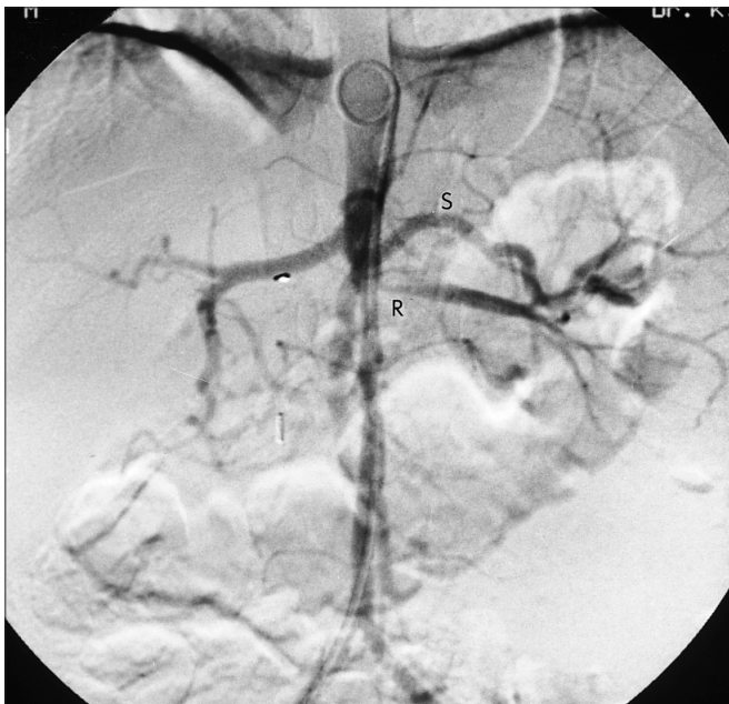
FIG. 1. Abdominal aortic angiogram prior to splenorenal bypass. There is significant narrowing of proximal left renal artery (R) and occlusion of superior mesenteric artery. Splenic artery (S) is well preserved and of good calibre.