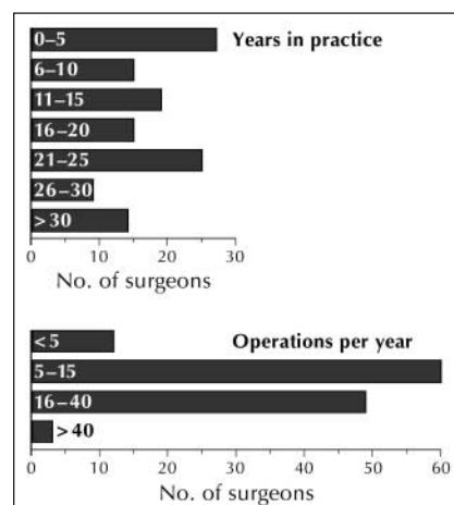
FIG. 1. Distribution of the 124 surgeons surveyed, according to their years in practice and number of operations for rectal cancer performed per year.