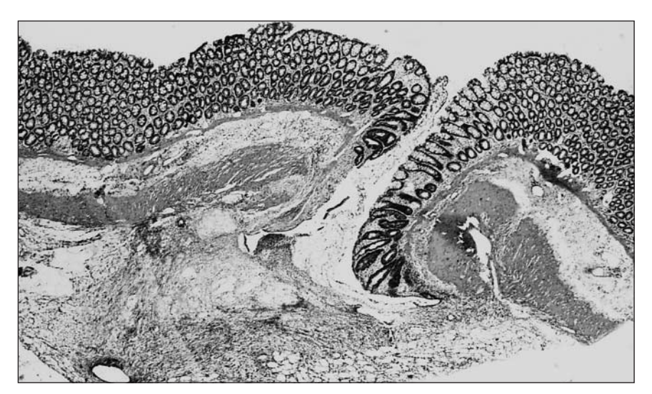
FIG. 1. Cross-section of a specimen from a rat in group 1 (colonic anastomosis only) demonstrates normal anastomotic wound healing on postoperative day 3. The gap between the anastomotic edges is filled by granulation tissue (hematoxylin-eosin stain; original magnification \times 10 ).

Sections of specimens taken from colonic segments of anastomotic areas are presented in Figure 1, Figure 2 and Figure 3. In Figure 1, histopathological examination of a