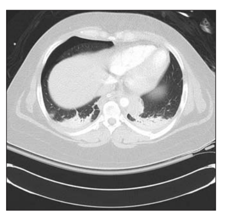
FIG. 1. An occult pneumothorax seen on a CT scan that was not detected on a plain anteroposterior supine chest radiograph.

A feature of posttraumatic pneumothoraces that is only now being appreciated as a result of the frequent use of CT is the insensitivity of the anteroposterior supine chest radiograph (AP CXR) to detection of pneumothoraces.56-58 Remarkably large occult pneumothoraces may be present without an obvious anterolateral pleural stripe on an AP CXR. (Fig. 1).50,56 Despite not being evident on CXR, all pneumothoraces are dynamic and evolve over time, potentially increasing if a flap valve is present. Both the clinical importance and optimal management of these posttraumatic pneumothoraces remain unknown because there has been little prospective study.<sup>59,60</sup> Thoracic sonography is a potential method of detecting posttraumatic pneumothoraces during the primary survey, with greater sensitivity for detecting occult posttraumatic pneumothoraces and without the delay of image processing.<sup>50,55,57,61</sup> The technique is conceptually simple and focuses on identifying a sonographic sliding movement at the pleural interface. If they are separated by even a small amount of air, these signals are lost. Although we feel this technique