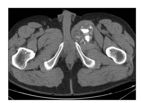
FIG. 3. Computed tomography scan showing a transverse image of the pelvis.