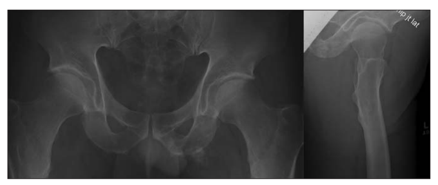
FIG. 2. Radiographs showing an anteroposterior view of the pelvis and lateral view of the left hip.