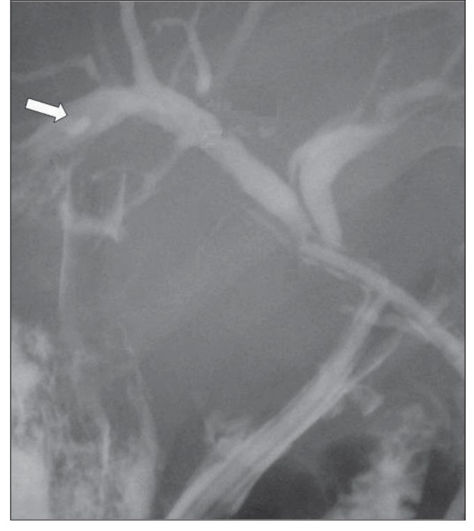
Fig. 2. Cholangiography performed via the T-tube demonstrating normal imaging of the common bile duct and the duodenum (11th postoperative day). There is a minor contrast medium leak from the right posterior segmental duct (arrow).

Communications between the cyst and the biliary tree are seen in 9%–25% of patients with echinococcal disease.<sup>2</sup> Radical surgery, including complete removal of the cyst along with the pericyst, remains the curative therapy of choice. There is a general consensus that meticulous common bile duct exploration and clearance of the cystic material from the biliary tree with restoration of normal bile flow should be performed. Although anatomic or