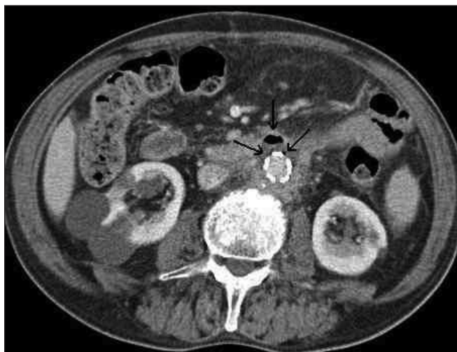
Fig. 2. A computed tomography scan showing air bubbles surrounding the prosthetic graft, indicative of graft infection (arrows). The pre-aortic hematoma has been reabsorbed.

tation — that the patient oddly had no fever, leukocytosis or other signs of such severe vascular infection — may explain why we did not suspect the infective nature of the pseudoaneurysm and why a diagnosis of iatrogenic aortic injury seemed more likely. It was only when the aortic anastomosis became disrupted 2 weeks after the tube graft was inserted that we suspected a prosthetic infection, but could not confirm it with laboratory and clinical findings. We subsequently chose an EVAR procedure in emergency conditions to repair the ruptured pseudoaneurysm or to attempt a more straightforward procedure to avoid the still-high mortality and morbidity of definitive major open surgery. On the other hand, even though acceptable results have been achieved with aortic endovascular prosthetic grafts used to repair pseudoaneurysms developing where initial open repair has failed, 2 using EVAR to treat infected pseudoaneurysms goes against general surgical principles because placing a foreign body in an infected field could exacerbate the infection. The recent literature has nonetheless increasingly emphasized EVAR in such circumstances, although it is still unclear whether this treatment is curative or a bridging procedure. 3,4