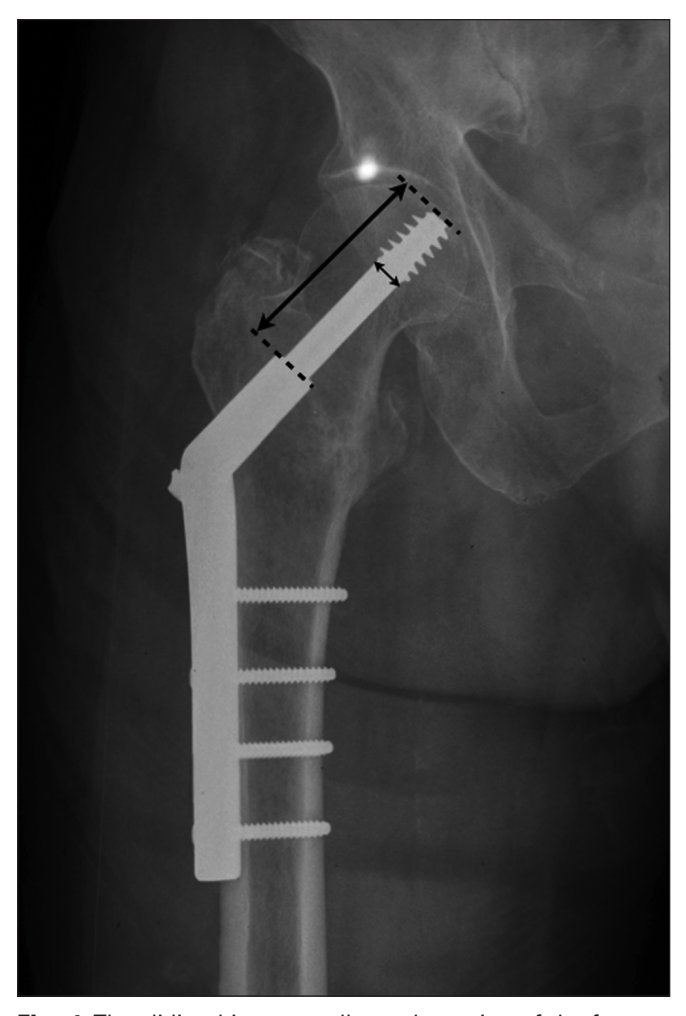
Fig. 1. The sliding hip screw allows shortening of the fracture along the lag screw, which can be quantified by measuring the portion of lag screw visible outside the barrel on anteroposterior films.

here was a recent call for "a change in the status quo in the management of pertrochanteric hip fractures"1 owing to poor functional outcomes2 and high reoperation rates with current management.3 Specifically, there was a call for research into the prevention of malunion secondary to shortening and shaft medialization. The Orthopaedic Trauma Association (AO/OTA) 31A2 pertrochanteric fracture group<sup>4</sup> is at risk for such malunion. The lateral wall in this group is at higher risk for fracture when treated with a sliding hip screw (SHS; 29.8% in the 31A2 group v. 7% in the 31A1 group), which leads to excessive shortening.5 This group is also characterized by variable amounts of comminution along the intertrochanteric line,<sup>4,6</sup> which can lead to shortening despite an intact lateral wall.<sup>3,7-10</sup> Up to 2.5 cm of shortening has been described in these fractures,<sup>3,10</sup> while as little as 1.3 cm<sup>11</sup> and 1.7 cm<sup>9</sup> has been associated with reduced patient mobility<sup>11</sup> and poor functional results.<sup>9</sup> The AO/OTA classification accounts for comminution; however, inter-observer agreement within the 31A2 group