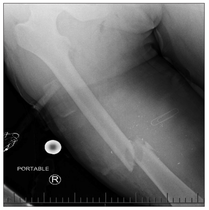
Fig. 1. Preoperative radiograph showing a comminuted fracture of the right femur and shrapnel from the ballistic injury. The medial aperture is marked with a metallic paper clip.

medial longitudinal approach was used, centred by the medial aperture wound and a very large hematoma was discovered and evacuated. Soft tissue injury of the underlying