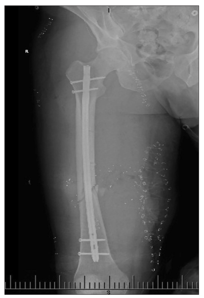
Fig. 3. Definitive interval orthopedic fixation with intramedullary interlocking nail. Note the metallic clips marking the medial initial approach.

was performed to prevent compartment syndrome. Total inflation time was 19 minutes, with an initial inflation of 17 minutes followed by temporary deflation and an additional re-inflation for 2 minutes. The REBOA catheter was removed at the conclusion of the procedure, leaving the introducer sheath inside the common femoral artery for 12 hours following the procedure. The patient received 14 units of packed red blood cells, 10 units of fresh frozen plasma and 10 units of platelets before REBOA deployment, and no transfusion products after REBOA. The patient returned to the operating room for open reduction and internal fixation of his fractured right femur on post-operative day 5 (Fig. 3). He was followed on the ward for further wound care (Fig. 4). No complications were attributed to the REBOA catheter placement.