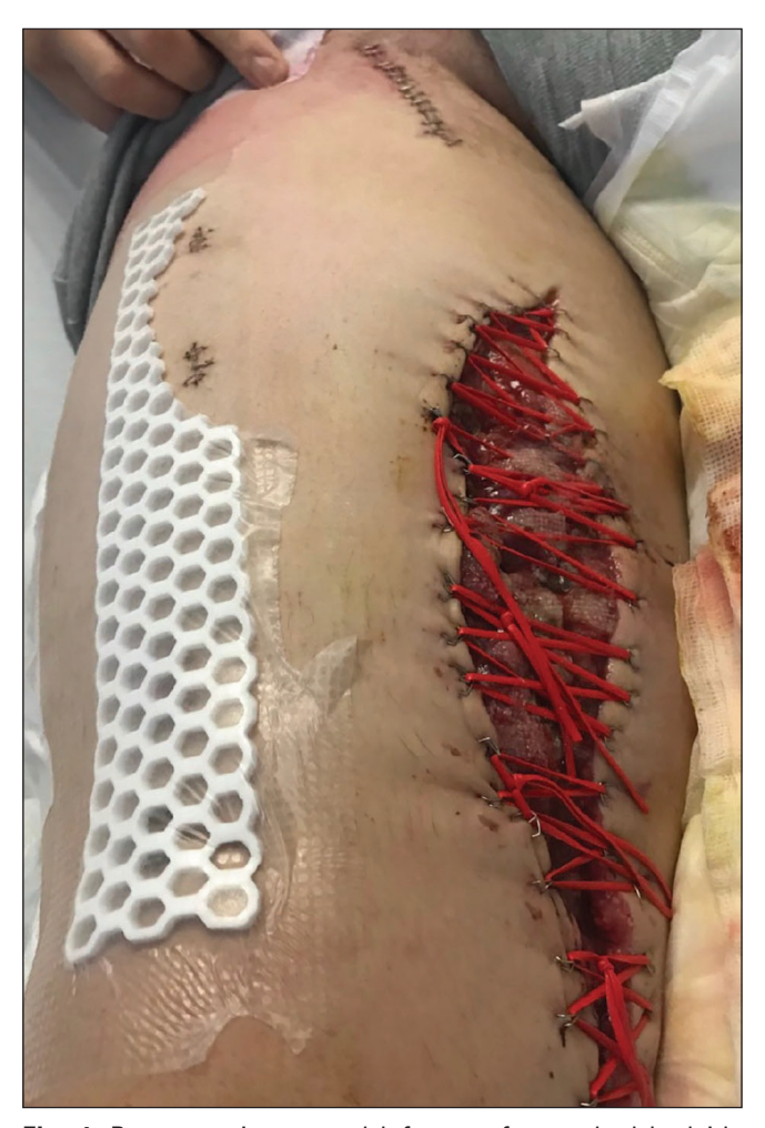
Fig. 4. Postoperative wound left open for gradual bedside tightening.

The principle of REBOA as a method of hemorrhage control was first described by Dr. Carl Hughes during the Korean war.<sup>2</sup> Although the first patients succumbed to their