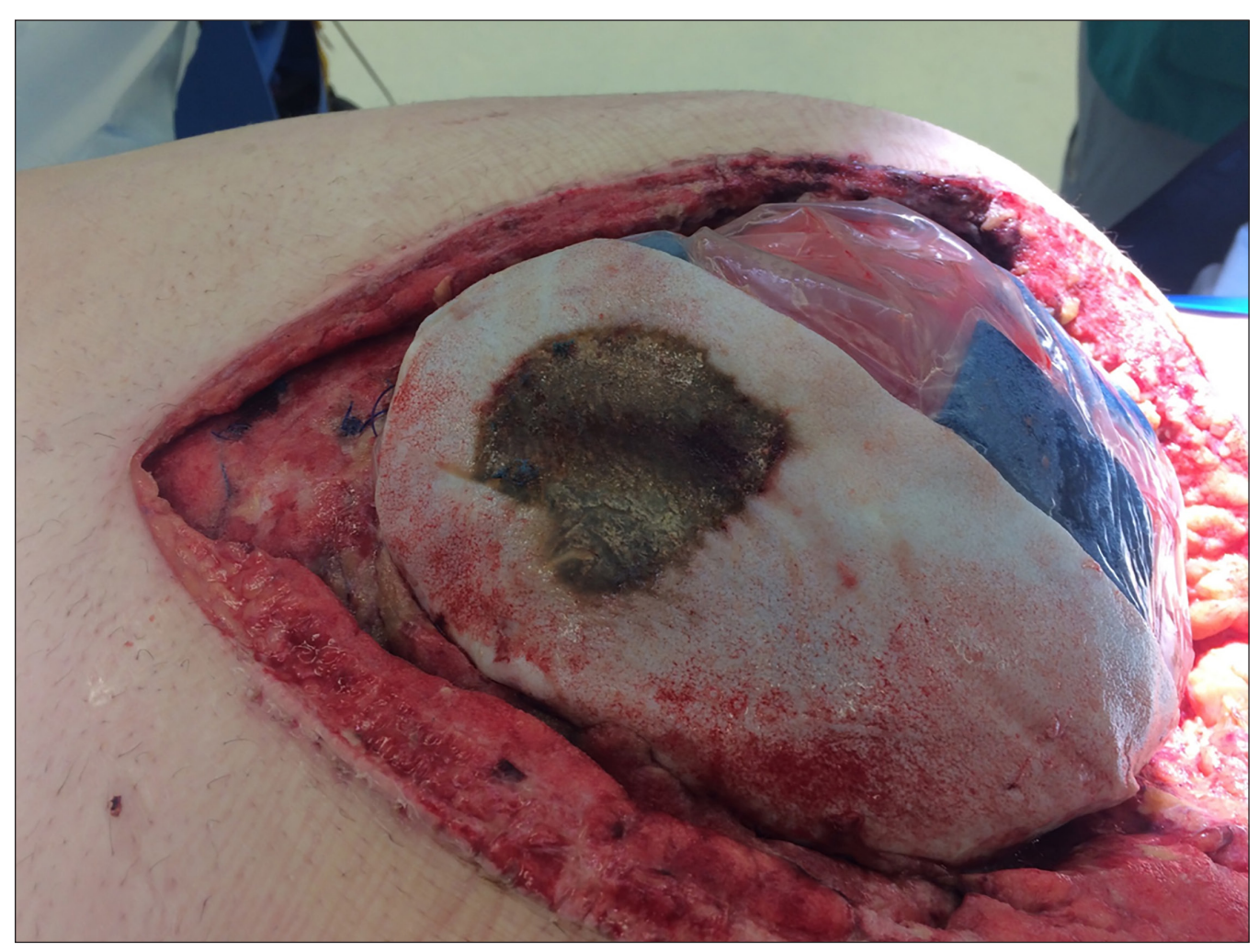
Fig. 1. Grossly discoloured bioprosthetic mesh in a 67-year-old man who underwent abdominal wall reconstruction.