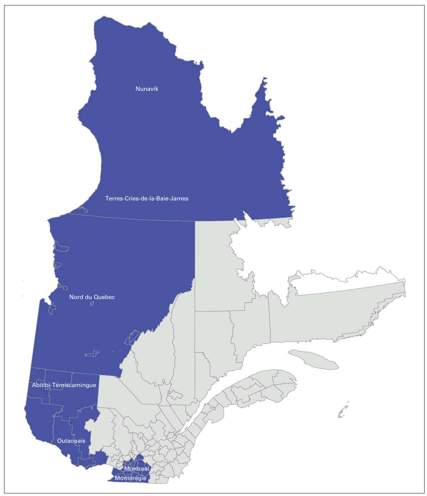
Fig. 1. Catchment area of McGill University Health Centre in Montréal, Quebec.

complete within 1 week of contact with our team. Patients from remote regions where resources are scarce are housed locally for as long as they need specialized care.<sup>26</sup>