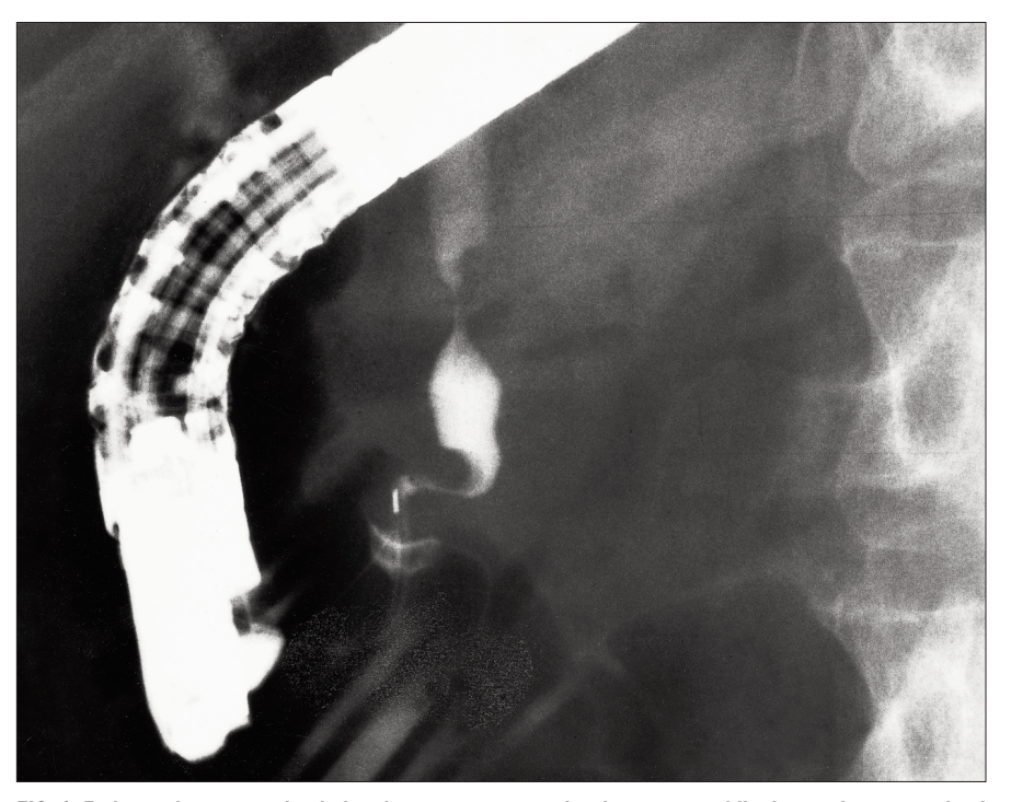
FIG. 1. Endoscopic retrograde cholangiopancreatogram showing common bile duct stricture proximal to the ampulla of Vater.

Examination of the tissue revealed a constricted area of the distal common bile duct, which was surrounded by a firm yellowish grey mass. Histologic examination (Fig. 2) showed an infiltrating tumour in the wall of the common bile duct, which was composed of nu-