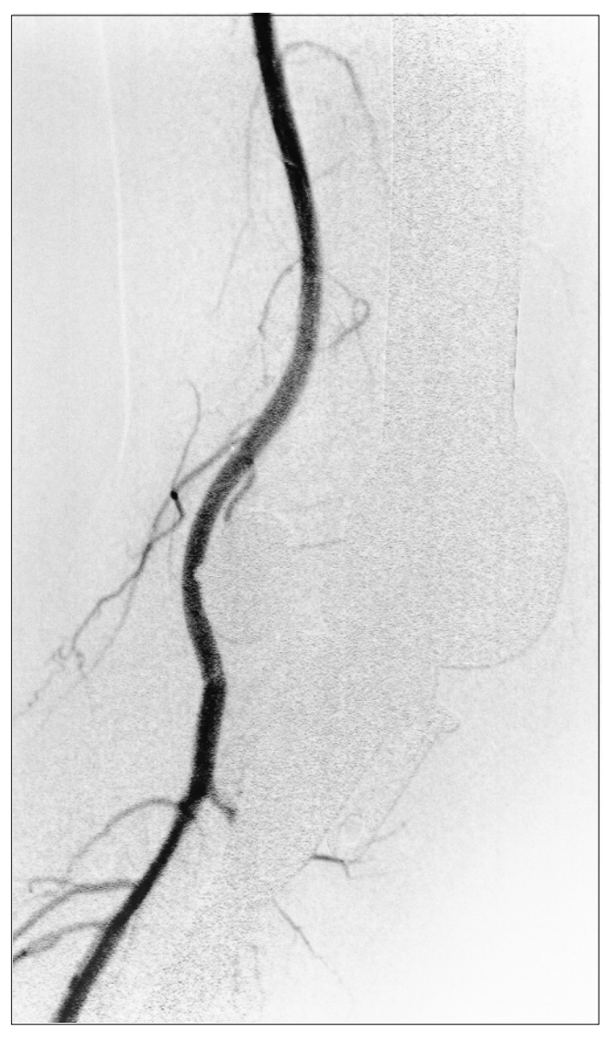
FIG. 3. Digital subtraction angiogram illustrating partial occlusion of the popliteal artery by one of the fixation pegs of the patellar component.