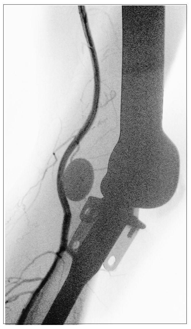
FIG. 2. Angiogram illustrating displacement of the popliteal artery by the displaced patellar component.