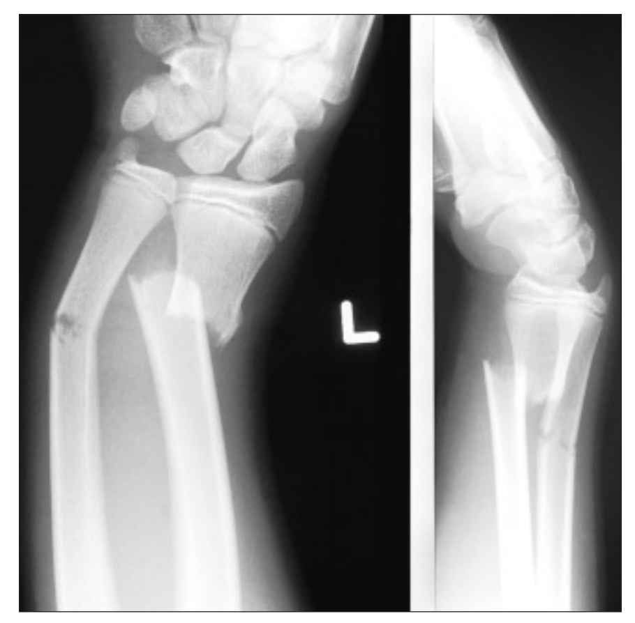
FIG. 3. A typical fracture of the distal radius and ulna in a 15-year-old boy, sustained in a forward fall after he lost control in a jump.

tion should be mandatory for novice snowboarders. We would agree that, given the large proportion of fractures of the distal radius in the pediatric population, the use of wrist guards similar to those used by inline skaters should be used by all skeletally immature snowboarders. The theoretical concern that use of wrist guards may predispose to more proximal upper limb injury has not been demonstrated. Given the frequency of wrist injuries, we feel that this theoretical risk cannot outweigh the real risk of fracture to the unprotected wrist of a snowboarder. As we did not directly examine the issue, we cannot make any recommendations regarding the preferential use of soft- or hard-shelled boots, or specific types of bindings. Bjornstig and Bjornstig<sup>15</sup> recommended the development of a release mechanism for the boots-board bindings, as well as the use of soft-shell boots for all