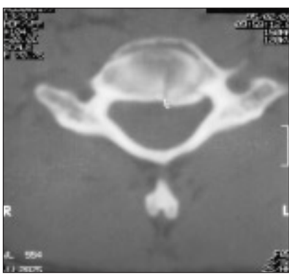
FIG. 4. A 17-year-old girl sustained a hyperflexion injury to her cervical spine in a high-speed snowboarding accident, shown in the lateral radiograph (top) and the computed tomography scan (bottom).

falling techniques should help novice snowboarders protect themselves from avoidable high-risk situations and should be strongly encouraged.