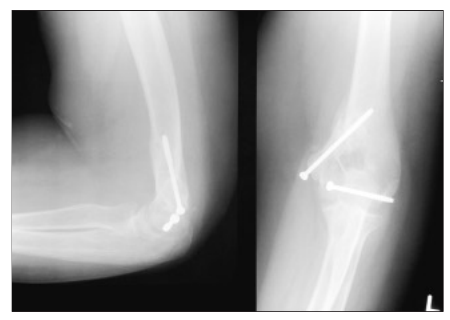
FIG. 1. Displaced fracture of the medial condyle in a 14-year-old boy (top), which required open reduction and internal fixation (bottom).

on the outstretched hand, 58 (88%) resulted in a fracture of the distal radius (30 right, 28 left) (Fig. 3).