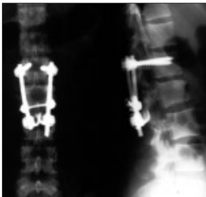
FIG. 4. Spinal instrumentation used in the treatment of a lumbar spine fracture to a 17-year-old girl who was wearing a 2-point belt.

A 1996 Suzuki Sidekick was struck on the driver's side by a 1988 Jeep Cherokee after the latter vehicle ran a stop sign. The Sidekick rolled onto its right side. Barrier speed was not applicable. The 2 occupants were a 29-year-old woman wearing a 3-point belt with airbag and a 3-month-old infant in a rear-facing carrier in the front passenger seat. An airbag deployed into the child's carrier seat.