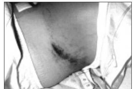
FIG. 3. Malposition of the lap seat belt causing bruising.

A 1997 Suzuki Swift struck a stopped tractor trailer. The BEV was 31 km/h. There was no evidence of compartment intrusion. The 2 occupants were a 27-year-old woman wearing a 3-point belt with airbag and a 4-year-old boy wearing a 3-point belt with airbag. The child sustained a fracture to the left orbital roof and maxilla with bruising to the