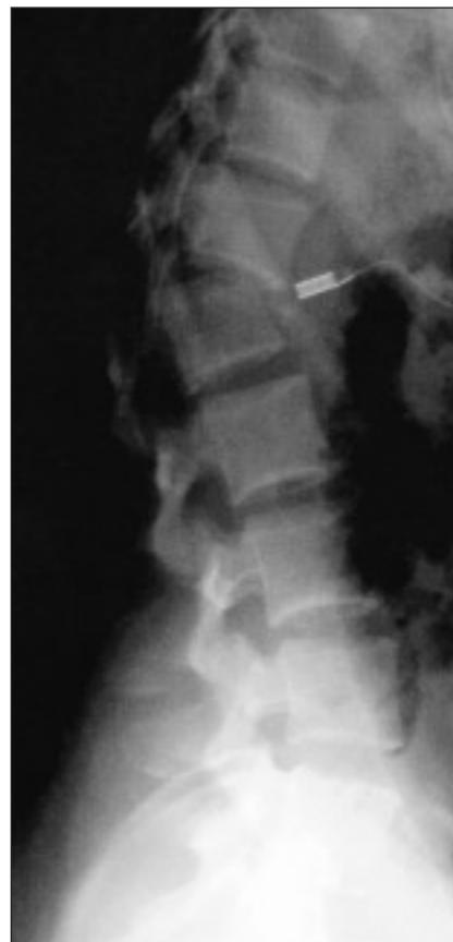
FIG. 2. Chance fracture in a 4-year-old boy.

A 1993 Honda Accord crossed the centre line to crash head-on with