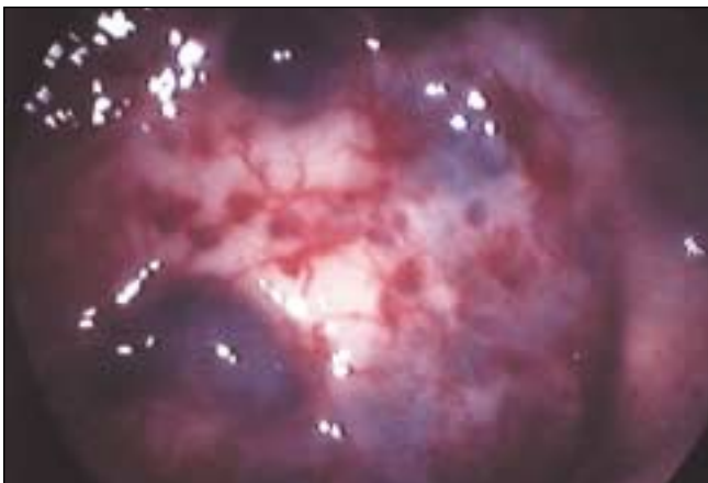
FIG. 1. Endoscopic view of the diffuse cavernous hemangioma of the rectum.

DCH of the rectosigmoid colon is an extremely rare malformation that is generally seen in young adults, with a male-to-female ratio of 2:1. 1 Patients usually suffer painless rectal bleeding and anemia. However, there may be associated intestinal obstruction, diarrhea, constipation and hematuria. 2 The presence of hemangioma in the cutaneous and mucous membranes, or Klippel-Trenaunay syndrome, should alert the clinician to the presence of rectal hemangioma. 3,4 Endoscopy is the method of choice for diagnosis. Upper gastrointestinal endoscopy should be done in all patients to rule out any synchronous hemangiomas. Other diagnos-