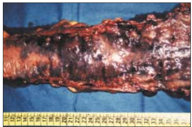
FIG. 2. Macroscopic view of the excised rectal cavernous hemangioma.