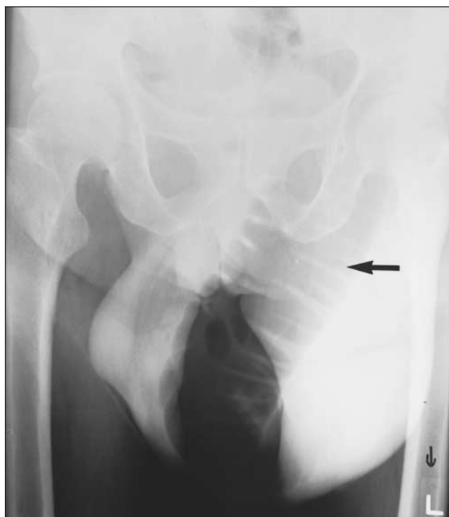
FIG. 1. Plain radiograph of the pelvis, showing a long, distended loop of colon (arrow) in a large left scrotal hernia.

Through a left inguinal incision, a huge hernial sac was delivered from