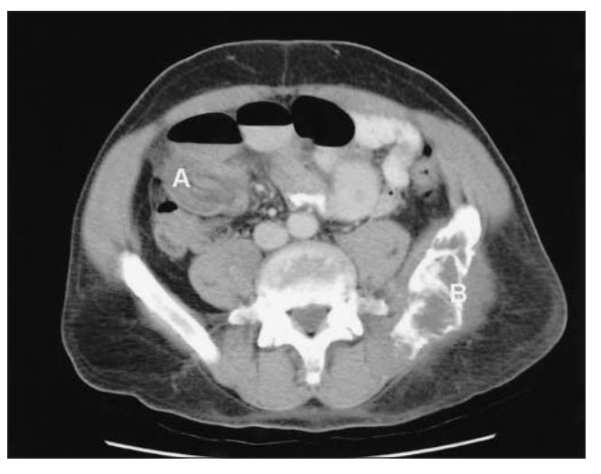
FIG. 2. Axial contrast-enhanced CT scan of the abdomen showing intussusception (A) in the right lower quadrant. A large mixed lytic and sclerotic lesion in the left hemi-pelvis (B) extending to the sacroiliac joint, typical of multiple myeloma, was noted.

From the Department of Surgery, Dalhousie University, and the Queen Elizabeth II Health Sciences Centre, Halifax, NS