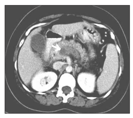
FIG. 4. A hypodense thrombus is seen within the portal vein (arrow) on axial contrast-enhanced CT.

The diagnosis of SMV thrombosis after appendectomy is usually not suspected clinically because the symptoms and the signs are nonspecific.<sup>3</sup> CT has proven effective in the diagnosis and evaluation of SMV and portal vein