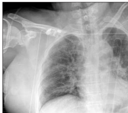
FIG. 1. Initial chest radiograph: probable bilateral pulmonary contusions were diagnosed. No mediastinal injury was seen; this was confirmed with infused CT scan.