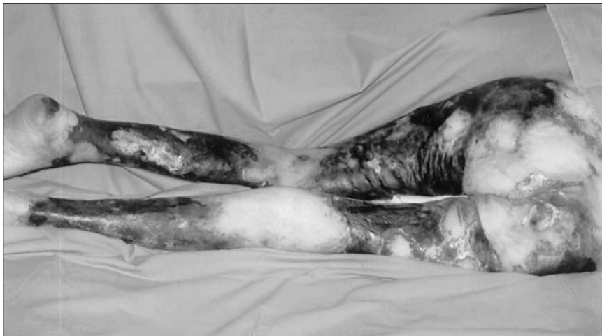
FIG. 1. Photograph taken at operating room showing the extent of the necrotic skin lesions.

The patient's condition deteriorated postoperatively; she developed pneumo-