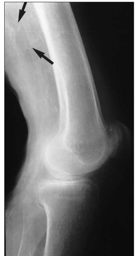
FIG. 2. Radiograph of the left leg. The arrow shows calcified small blood vessels.