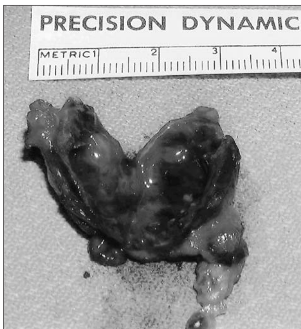
FIG. 4. Right superior parathyroid adenoma (3.96 g).