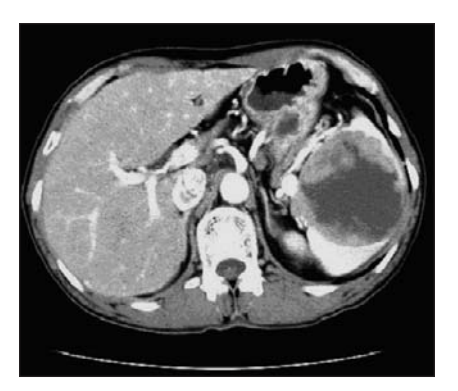
FIG. 1. CT scan of case 1 showed a lowdensity mass in the spleen in enhanced modes.

A 60-year-old man visited our hospital complaining of left upper abdominal discomfort and weight loss of about 10 kg in the last 6 months. The patient had a long history of alcohol intake (about 40 years). Ultrasonography showed a low echoic mass in the spleen. An abdominal CT scan (Fig. 1) confirmed a low-density hypovascular mass located in the spleen and measuring 6.9 \times 7.1 cm, and necrosis