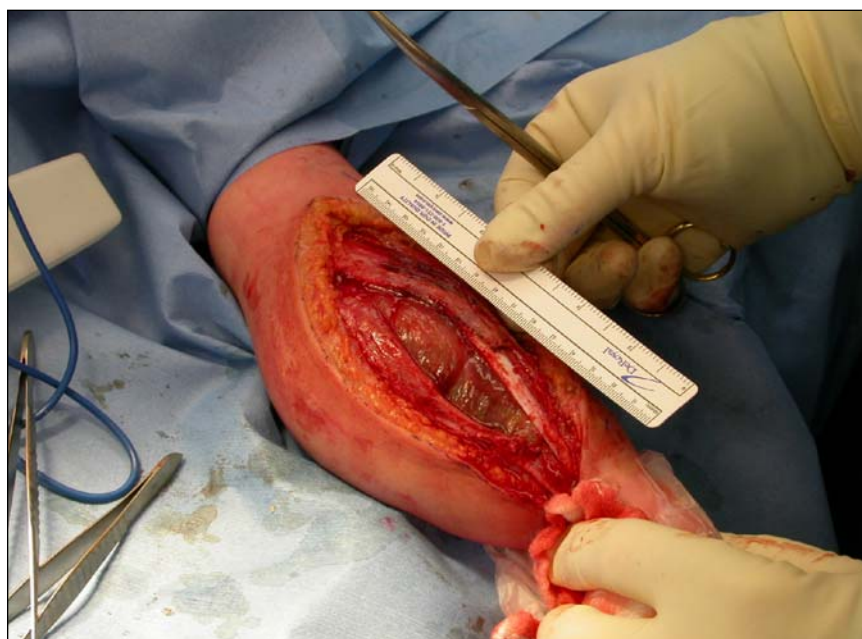
FIG. 2. Intraoperative photograph revealing completed fasciotomy exposure as well as retraction of skin edges.

from one another by 9 cm. Superficial muscles were bleeding and contractile at the end of the procedure. We applied a vacuum-assisted closure dressing to the open area. Postoperatively, the child reported a significant decrease in her arm pain. Twelve hours later, she had regained active painless finger extension and flexion, although there was a persistent decrease in interosseous muscle function. On sensory examination, the findings were normal. The vacuum-assisted closure dressing was changed on postoperative day 3, and the fasciotomy was ultimately closed by a plastic surgeon who used a split-thickness skin graft from the child's right thigh on postoperative day 7.