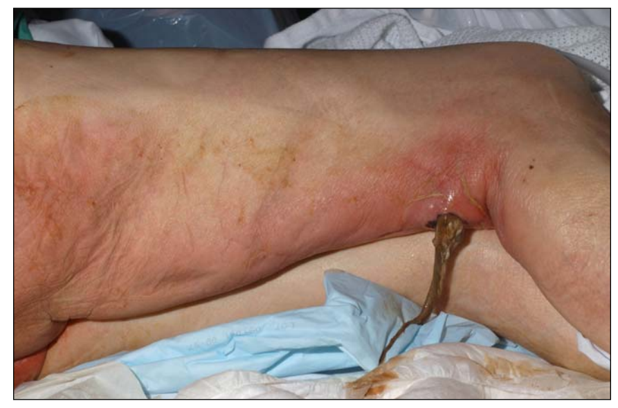
FIG. 1. A feculent discharge can be seen in the right popliteal fossa.

In November 2001, the patient had a low anterior resection for a giant dysplastic tubulovillous adenoma 8 cm from the anal verge, with formation of a J pouch