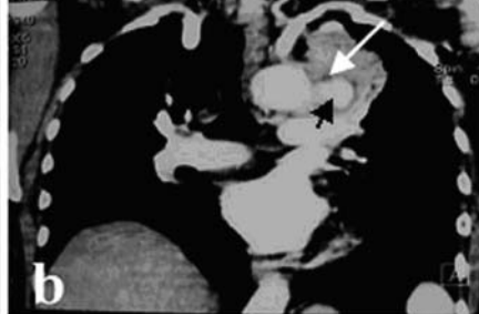
FIG. 1. Contrast-enhanced CT scan in (a) cross-section CT and (b) the coronal plane, shows a rtic arch bleeding ( 4 \times 4 \times 3 cm, black arrow) encapsulated within a mass ( 10 \times 9 \times 8 cm, white arrow) in the superior lobe of the left lung.