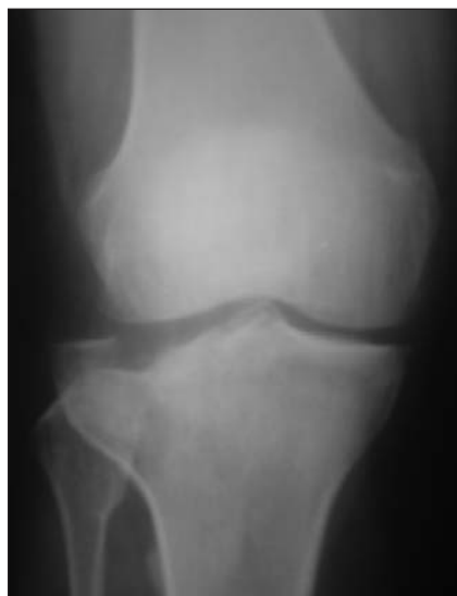
FIG. 1. Preoperative anteroposterior radiograph of a 58-year-old woman with a type III fracture.

Arthroscopically assisted percutaneous fixation, which was first recommended by Caspari 17 and Jennings, 18 has gradually become popular since its initial use as a diagnostic tool. The advantages of AAPO include the direct vision of the intra-articular fracture, a more accurate reduction, lower morbidity compared with ORIF, better assessment and immediate treatment of intra-articular soft tissue lesions, prevention of soft-tissue complica-