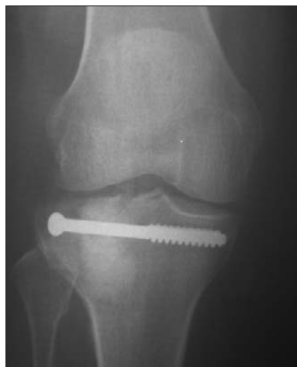
FIG. 2. Early postoperative anteroposterior radiograph showing sufficient reduction after the defect was filled by graft and strengthened by a screw.