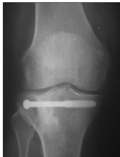
FIG. 3. Anteroposterior radiograph obtained 19 months after surgery, showing an excellent result.