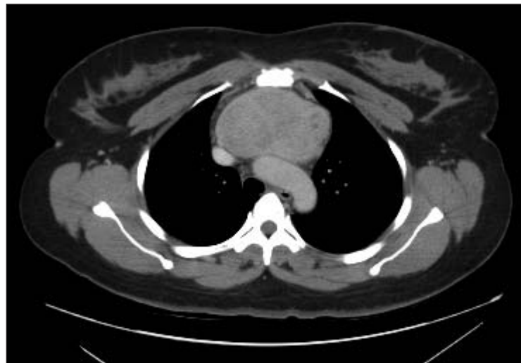
FIG. 1. Computed tomography scan showing the goitre as a large retrosternal mass extending into the anterior superior mediastinum.

The mass was mobilized from the pericardium, the mediastinal pleurae and great vessels with the use of a combination of blunt and sharp techniques. The vascular supply was from pericardial and thymic vessels, which were divided after control with hemoclips. At the superior-most aspect of the dissection, the innominate vein was effaced. The innominate vein and the distal left subclavian veins were encircled for vascular control. The venous tributaries to the mass were divided, and the specimen was