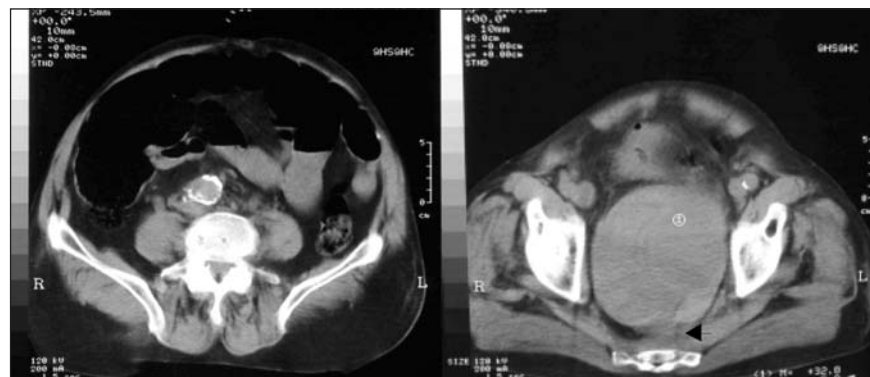
FIG. 2. Computed tomography scan shows rectosigmoid compression by an enormous aneurysm. Arrowhead indicates the location of the rectum.

From the Vascular Surgery Service, Department of Surgery, Centre hospitalier de l'Université de Montréal (CHUM) — Hôtel-Dieu, Montréal, Que.