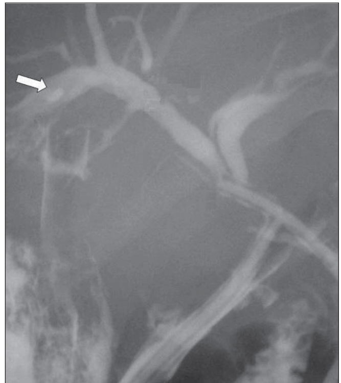
Fig. 2. Cholangiography performed via the T-tube demonstrating normal imaging of the common bile duct and the duodenum (11th postoperative day). There is a minor contrast medium leak from the right posterior segmental duct (arrow).