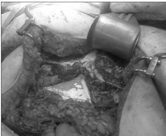
Fig. 2. An intraoperative photograph shows the repair of the thoracic wall, reattachment of the anterior diaphragm to the costal margin and the medial defect filled with composite mesh.

Acute abdominal wall herniation and diaphragmatic ruptures are rare yet well described complications of blunt abdominal trauma. They are most commonly associated with motor vehicle collisions and with the use of seatbelts. 1 The incidence of traumatic abdominal wall herniation is estimated at less than 1% 3 and diaphragmatic rupture