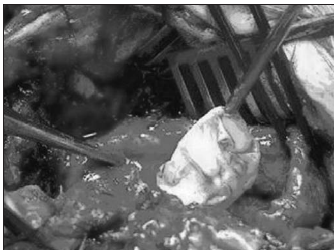
Fig. 2. Removal of the parasite in patients with hydatid disease who had previously treated cysts.

The total oral dose of albendazole varied between