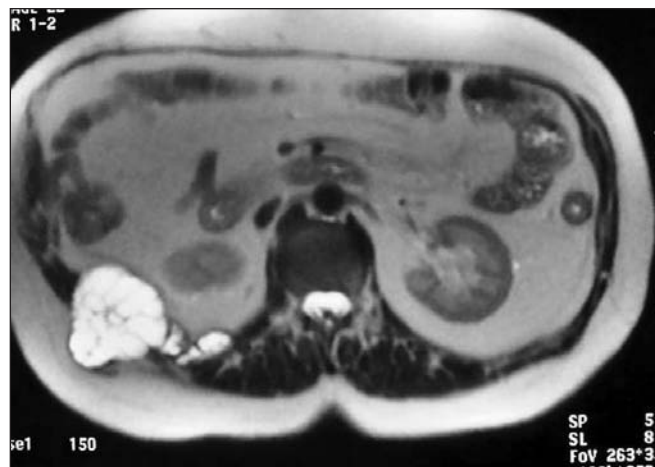
Fig. 3. Abdominal magnetic resonance imaging scan demonstrating peritoneal (perihepatic) rounded opacities (re-recurrence from previously thrice-operated echinococcosis of the liver).