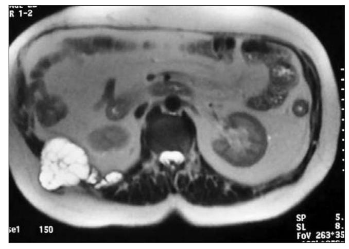
Fig. 3. Abdominal magnetic resonance imaging scan demonstrating peritoneal (perihepatic) rounded opacities (re-recurence from previously thrice-operated echinococcosis of the liver).

The total oral dose of albendazole varied between