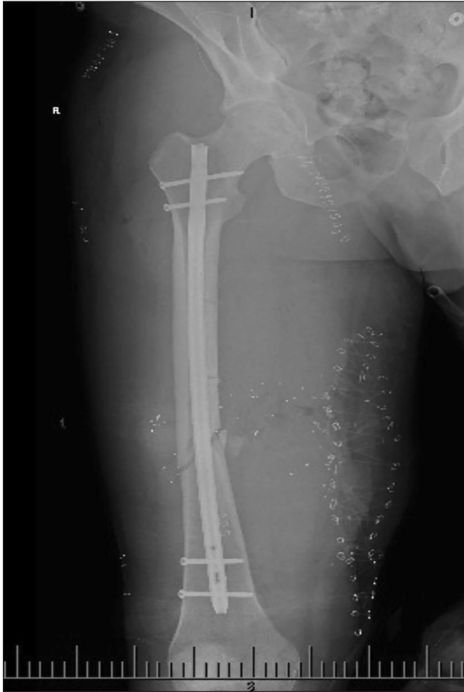
Fig. 3. Definitive interval orthopedic fixation with intramedullary interlocking nail. Note the metallic clips marking the medial initial approach.

was performed to prevent compartment syndrome. Total inflation time was 19 minutes, with an initial inflation of 17 minutes followed by temporary deflation and an additional re-inflation for 2 minutes. The REBOA catheter was removed at the conclusion of the procedure, leaving the introducer sheath inside the common femoral artery for 12 hours following the procedure. The patient received 14 units of packed red blood cells, 10 units of fresh frozen plasma and 10 units of platelets before REBOA deployment, and no transfusion products after REBOA. The patient returned to the operating room for open reduction and internal fixation of his fractured right femur on postoperative day 5 (Fig. 3). He was followed on the ward for further wound care (Fig. 4). No complications were attributed to the REBOA catheter placement.