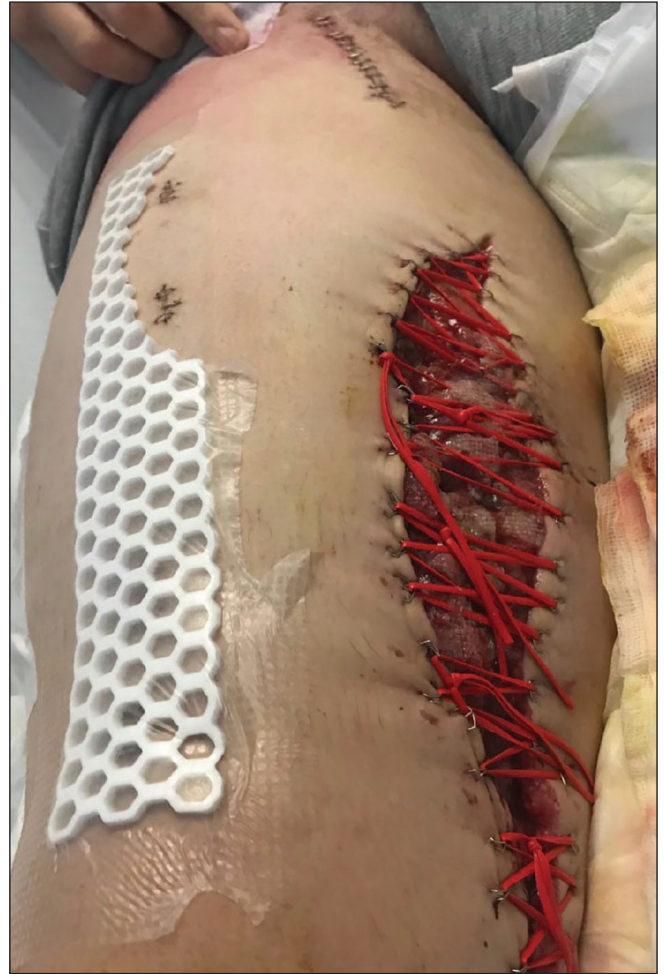
Fig. 4. Postoperative wound left open for gradual bedside tightening.

The principle of REBOA as a method of hemorrhage control was first described by Dr. Carl Hughes during the Korean war. 2 Although the first patients succumbed to their