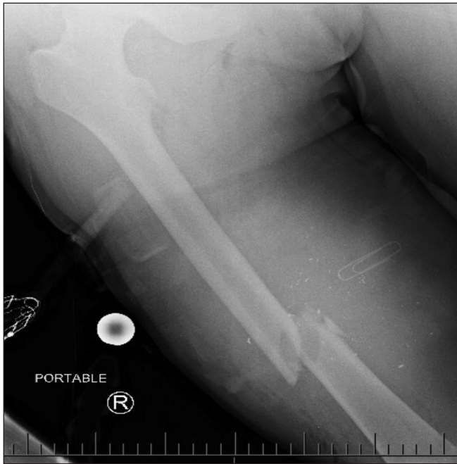
Fig. 1. Preoperative radiograph showing a comminuted fracture of the right femur and shrapnel from the ballistic injury. The medial aperture is marked with a metallic paper clip.

medial longitudinal approach was used, centred by the medial aperture wound and a very large hematoma was discovered and evacuated. Soft tissue injury of the underlying